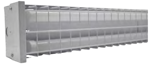
Wire Guard Batten